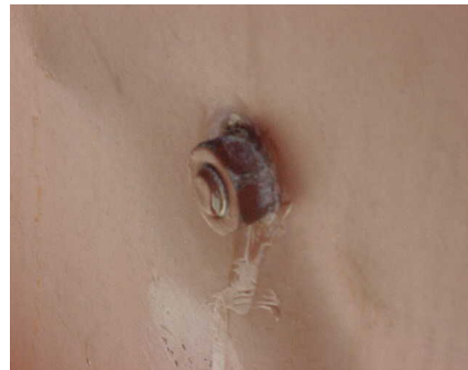
Pic 12. Container at depot. Door locking handle retainer nut/bolt. Paint missing from the bolt threads and unknown residue on the nut.

The retainer nut on one of the containers was embedded in a hardened grey putty like substance similar to the covering over the nut immediately below it — see Pic 10. From its appearance it looked like the retainer nut may also have been completely covered at some point and that the substance was damaged due to the nut being turned. This substance was similar to that seen on the breached container at the importers site. The nuts on the handle retainers on the other two containers had a white substance around them, as depicted in Pics 11 and 12. Both had paint missing from the bolt threads.