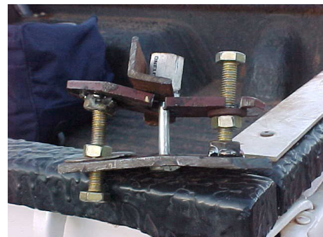
Pic 3. Primitive 'puller' constructed in an attempt to separate the locking chamber from the shaft.