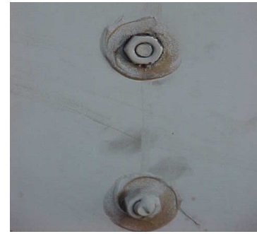
Pic 4. Back of the container door showing the door locking handle retainer bolt/nut. The nut appeared to have been tampered with.

The padlock, which at that time was being used to lock the container doors, remained attached to the retainer and handle and was completely ineffective in preventing the door from being opened. See Pics 5, 6, 7, 8 and 9. This would also have been the case had a bolt seal been in the mechanism.