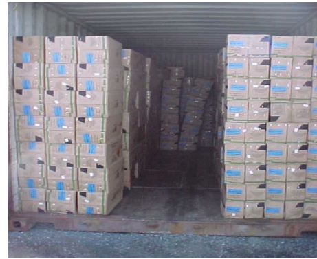
Pic 2. View inside container still on site after six of the centre stacks (54 boxes) were unloaded exposing empty space inside and a stack plus other boxes missing at the far end of the container.

The following morning a closer examination of the container was carried out. Again, nothing untoward was seen on the outside. The inside of the door told a different story. The various bolts retaining the door hardware were painted over and in some cases the ends of the bolts were spot welded to the nut however, the nut holding the door locking handle retainer appeared to have been tampered with. Paint was missing from the end of the nut/bolt and its appearance indicated that the nut had been removed at some stage (see Pic 4). The nut was embedded in a putty like substance. The bolt was a hex bolt and not a mushroom head indicating that the mechanism had been subject to some sort of maintenance.