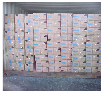
Pic 1. Reconstruction of view of the boxes when the container doors were opened on the first container.

Interactions with the Police are not dealt with in this newsletter.