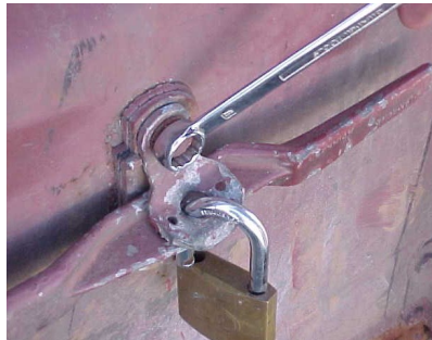
Pic 6. Bolt being extracted.