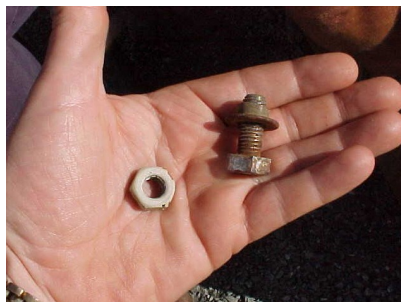
Pic 8. Hex bolt and nut removed from the locking handle retainer.