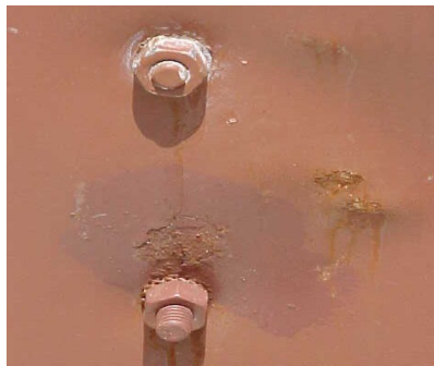
Pic 11. Container at Depot. Door locking handle retainer nut/bolt. Paint missing from the bolt threads and unknown residue on the nut.