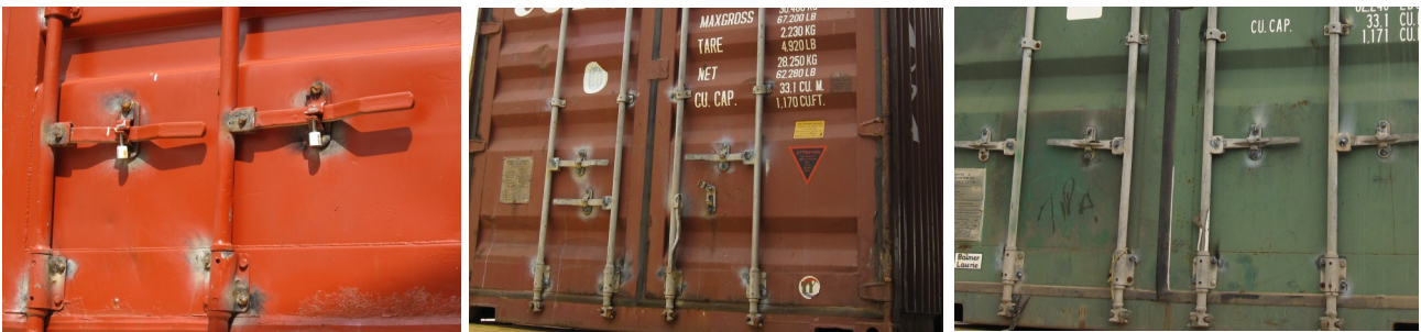
Pics 13, 14 and 15. Spot welding of bolts on the outside of purchased containers to enhance security and prevent bolts from being removed to gain entry to the containers.

The exporter's container inspection check sheets were amended to include confirmation that the above had been carried out prior to the loading of containers, irrespective of the type of product being loaded. See Pics 13, 14 and 15.