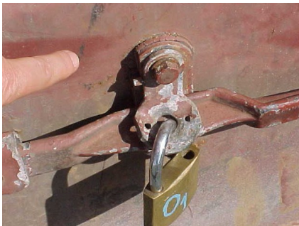
Pic 5. Locking handle retainer with hex bolt.