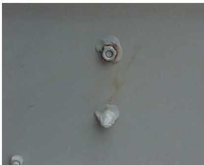
Pic 10. Container at depot. Door locking handle retainer nut/bolt. Damaged putty like material around the nut

The three containers were inspected. They all had the same door locking handle retainer mechanism design as the apparent breached container examined at the importers site and hex bolts were used on the mechanisms. It was apparent that the retainer bolt/nut on each of them had also been tampered with.