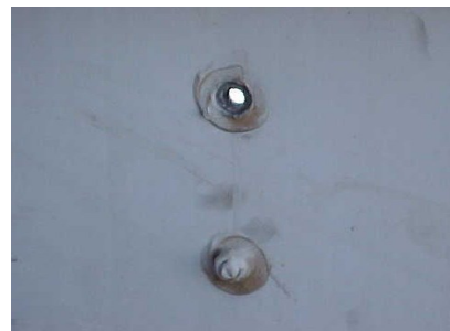
Pic 9. Bolt and nut removed. Slightly raised putty like substance can be seen around the hole.

The nut was then repositioned at the hole at the back of the container door and held in position by the putty like substance, door closed, retainer put in place and the bolt screwed back. It took several attempts before the bolt/nut threads connected and the bolt/nut tightened.